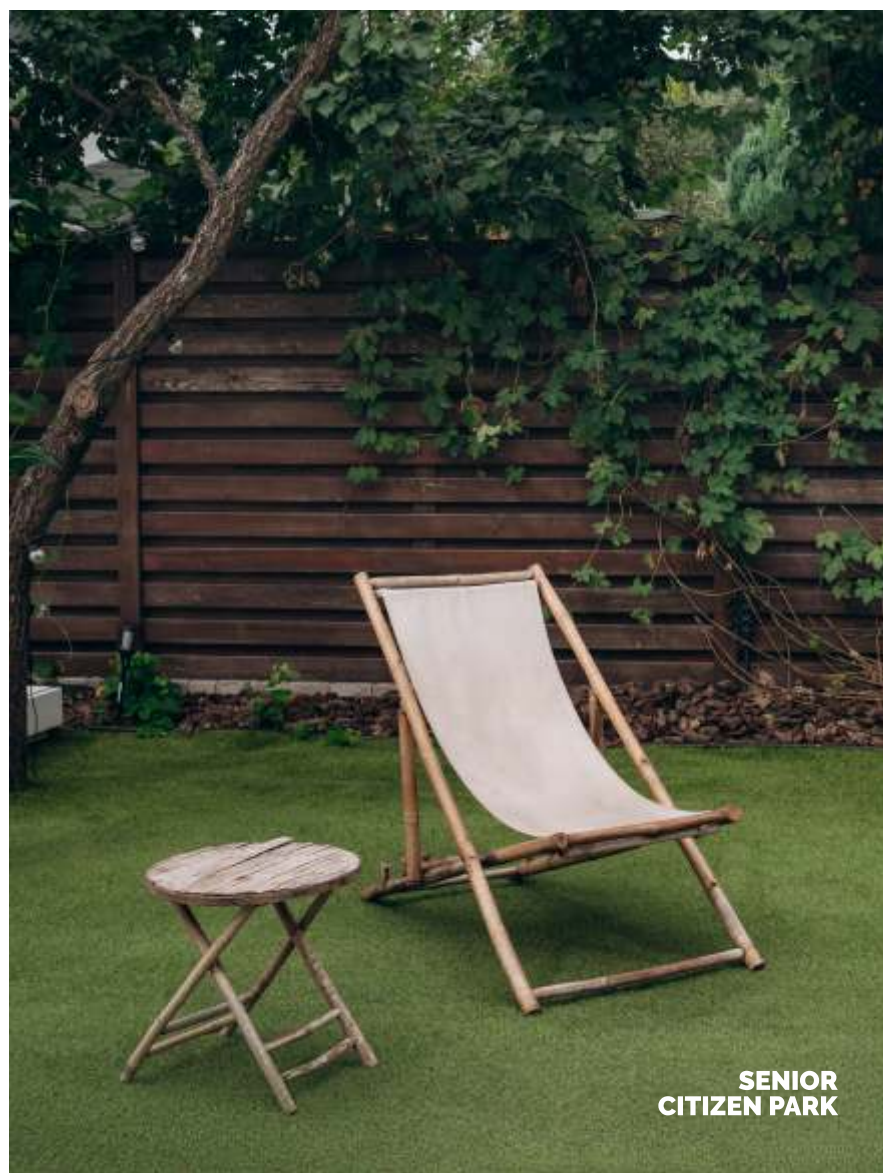
SENIOR CITIZEN PARK