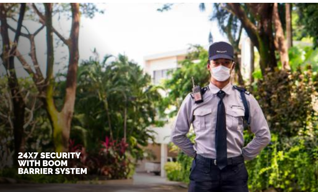
24X7 SECURITY WITH BOOM BARRIER SYSTEM