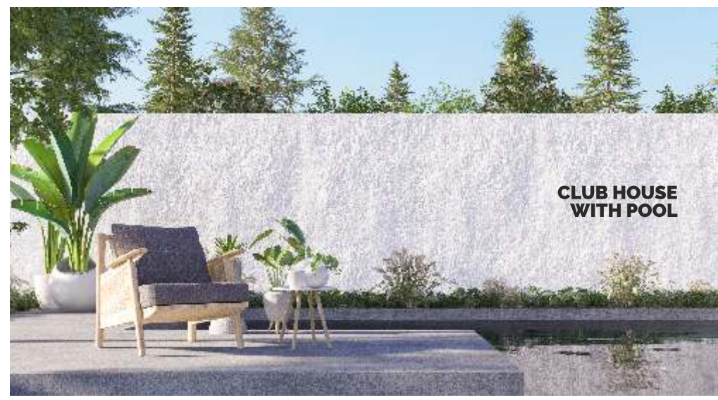
CLUB HOUSE WITH POOL