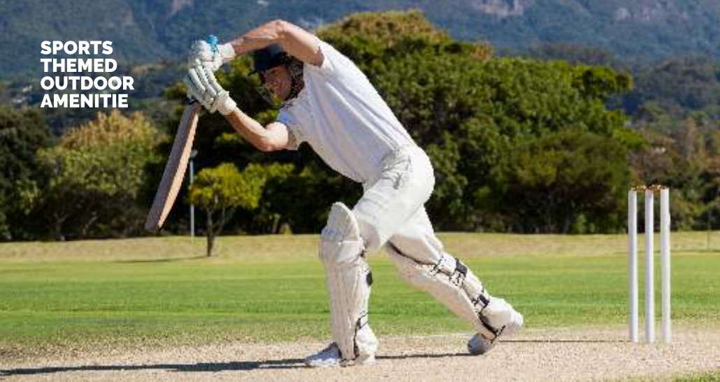
SPORTS THEMED OUTDOOR AMENITIE